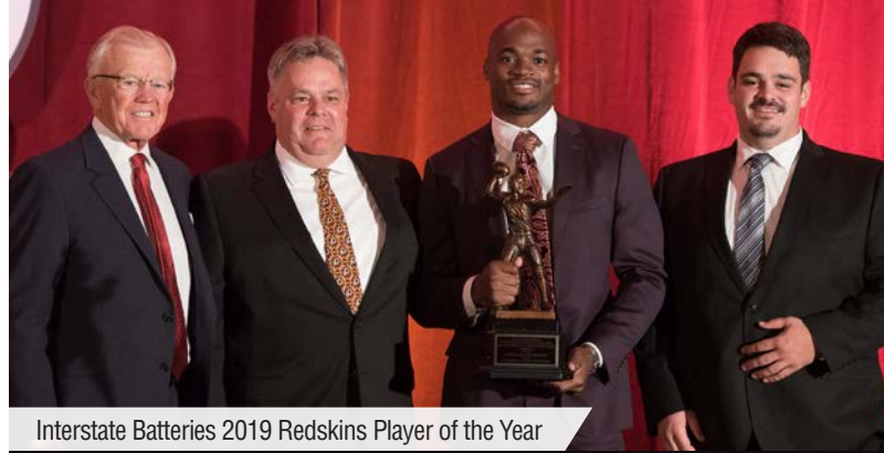
Interstate Batteries 2019 Redskins Player of the Year