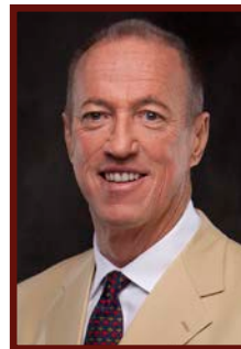
Featured Guest JIM KELLEY NFL Hall of Fame Quarterback