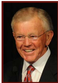
Host JOE GIBBS Founder and Chairman, Youth For Tomorrow