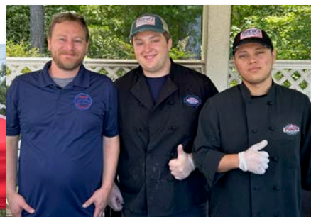
The players and volunteers indulged in delicious food provided by our Friends at Chuy’s Tex-Mx and Ford’s Fish Shack